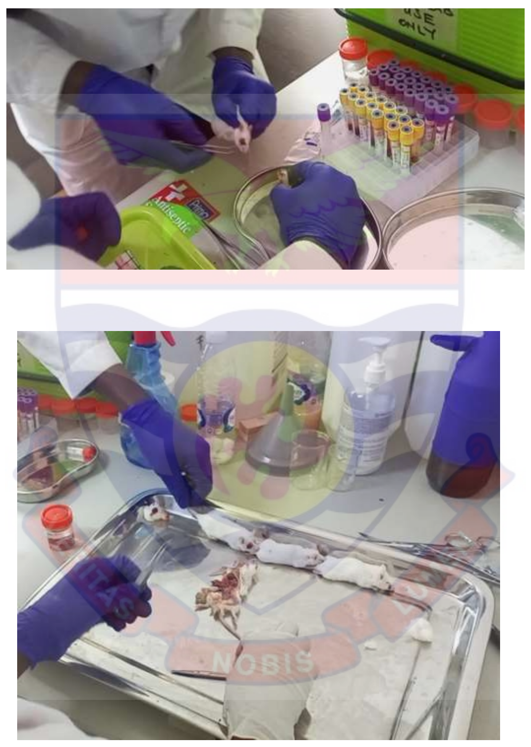
APPENDIX B. Collection of Haematology and Blood Biochemistry