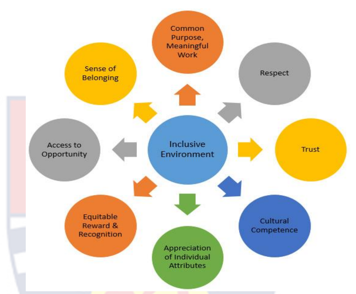
Figure 1: Inclusivity Wheel