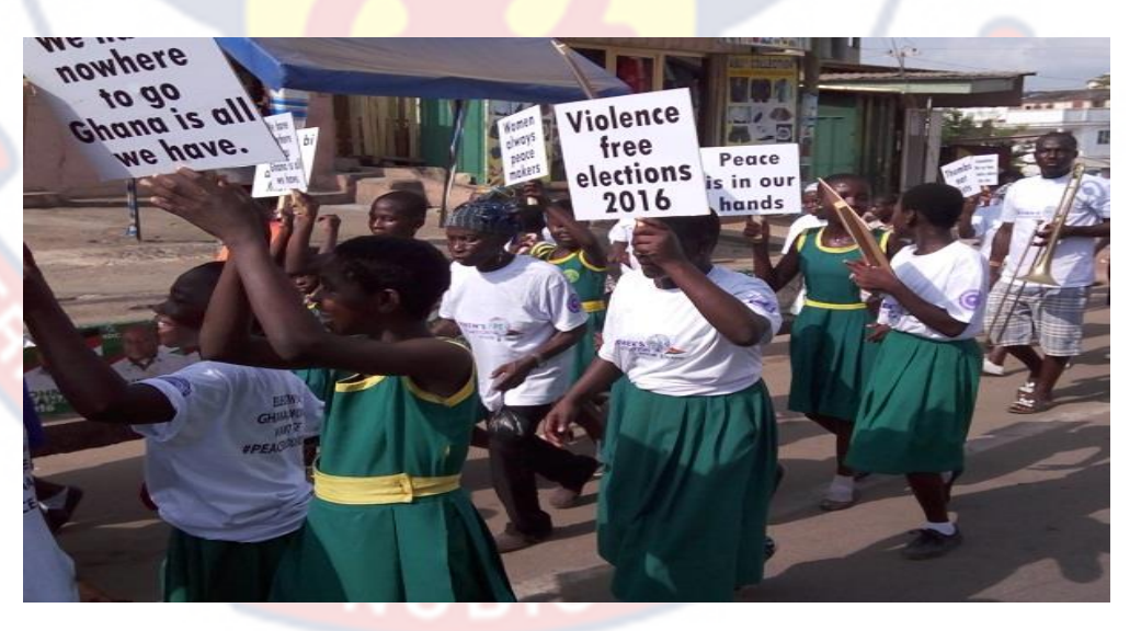
Figure 8 : Children marched in a Procession while Singing Peace Songs

Children in the Figure 8 marched in a procession while singing peace songs and holding placards that read: Love Peace for the Sake of God, Violence Free Election and No Peace, No Development. All of these were intended to send a message to decision-makers about their desire to put an end to the protracted conflict in a peaceful manner.