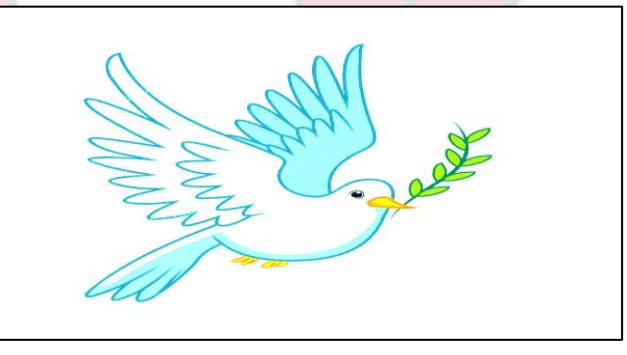
Figure 5: The Dove and Olive Leaf

According to the Board Chairman, of the NPC, the Peace Council has stuck to the use of Adinkra symbol for its official purposes.