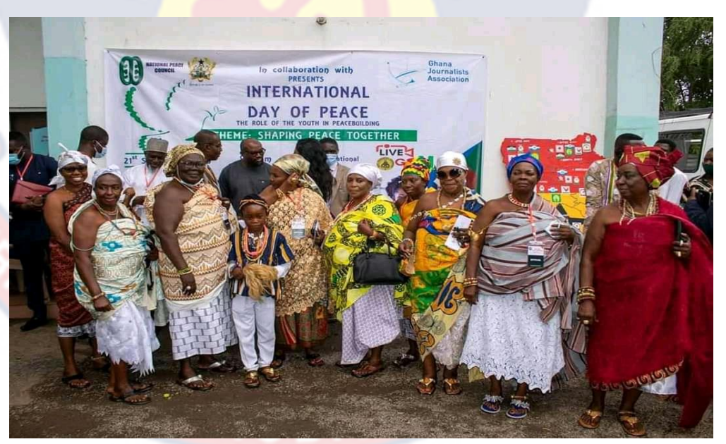
Figure 11 : NPC engaged Women Group during the 2020 International Peace Day

In all of NPC's programmes for economic empowerment, the institution reaches out to the women who are most in need, frequently by collaborating with grassroots, traditional rulers, and civil society groups. Some rural women, domestic labourers, some migrant groups, and women with low skill levels are some examples of particularly marginalised groups. The goal of NPC includes more security, including safety from violence; better access to and control over resources; and higher wages.