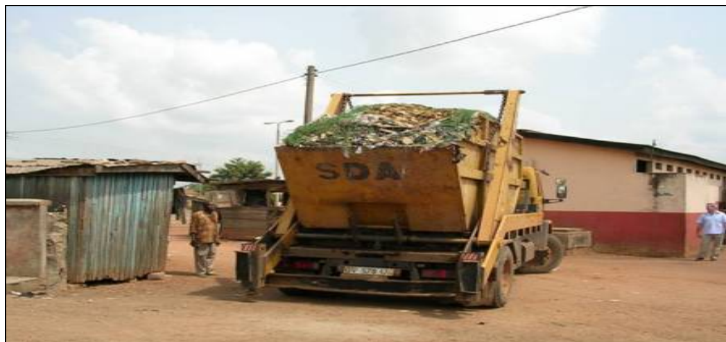
Plate 2: Sunyani District Assembly transferring refuse to the land fill site