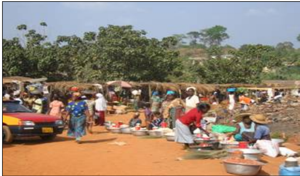
Plate 4: Indiscriminate dumping at a market place in Sunyani