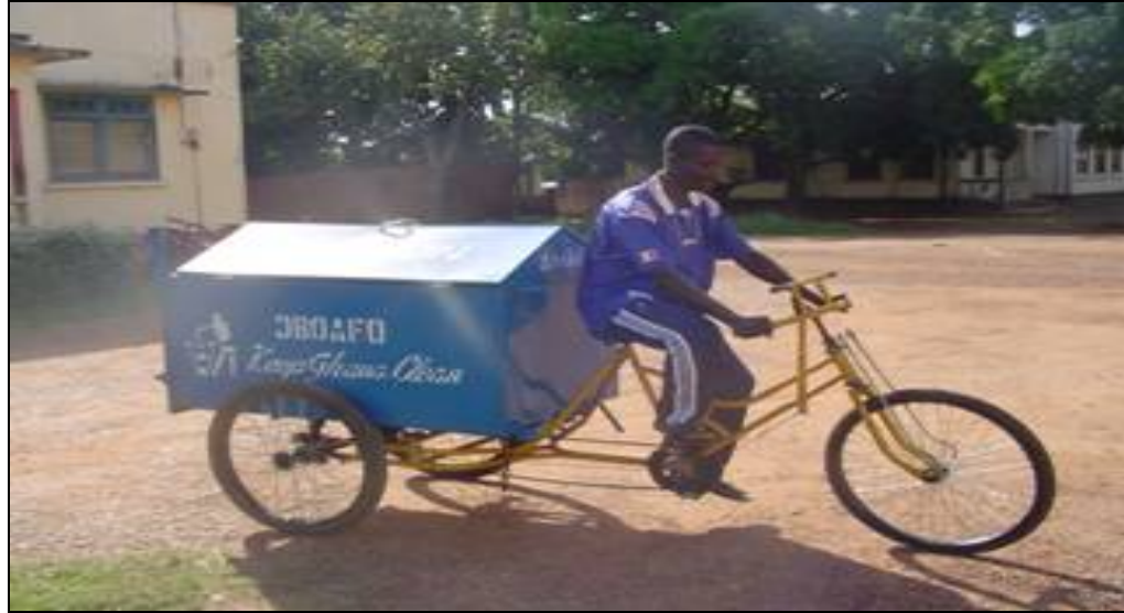
Plate 3: Private waste management company collecting waste