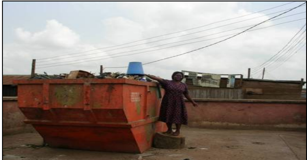
Plate 1: Typical transfer station in Sunyani

choked with refuse and this pose health risk to the inhabitants as shown in plate 5.