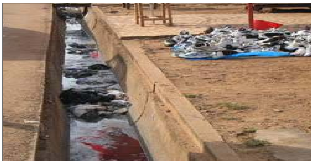
Plate 5: A Typical scene at urban community in Sunyani (choked gutter)