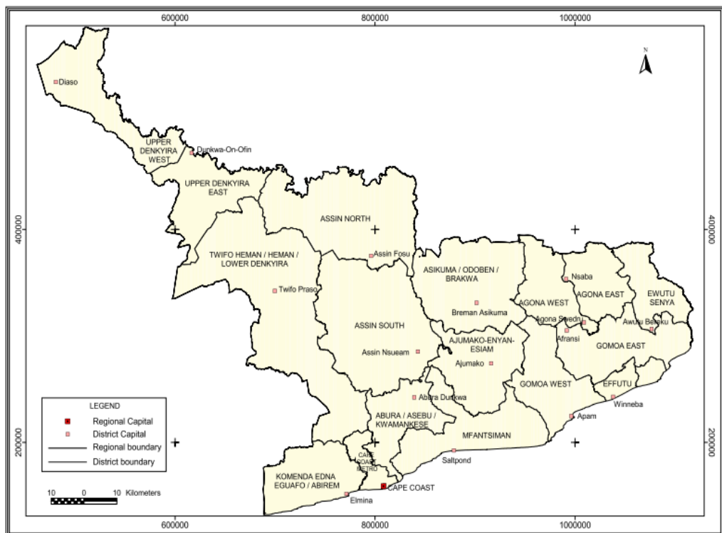
Figure 1: Map of Central region showing Districts

The study was conducted in the Central Region of Ghana. It occupies an area of 9,826 square kilometers or 4.1% of Ghana’s land area, making it the third smallest in area after Greater Accra and Upper East. It shares common boundaries with Western Region on the west, Ashanti and Eastern Regions on the north, and Greater Accra Region on the east. On the south is the 168-kilometre length Atlantic Ocean (Gulf of Guinea) coastline. The region's economy is dominated by services followed by mining and fishing. The figure below shows the study area.