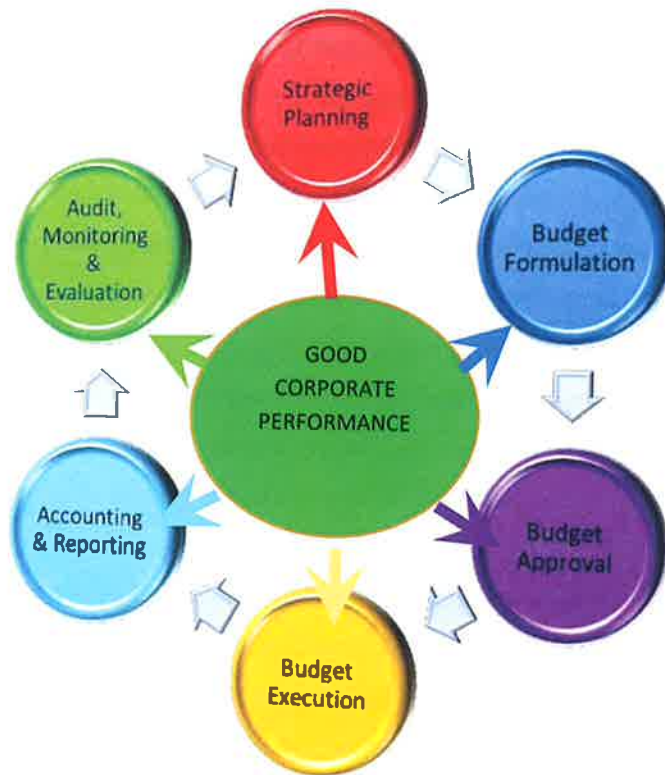
Figure 9.1: Financial Management Framework