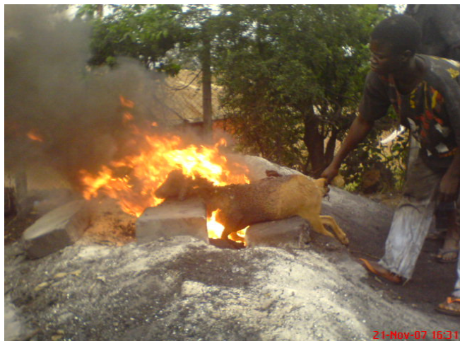
Figure 3. Singeing of goat in open fire fuelled with scrap tyres

Products Order, 1973). Thus, prior to singeing with the scrap tyres, the hides were already contaminated with unacceptable levels of Cd, Zn and Pb. This might be reflecting undue levels of heavy metal exposure in the local environment. The animals could potentially have picked heavy metals from the environment given the challenges of free-range grazing, scavenging in open waste dumps for fodder, drinking water from polluted drains and streams and exposure to atmospheric depositions especially from automobile fumes and open burning of solid waste. Indeed, close correlation have been reported between heavy metals concentration in cattle tissues with that in soil, feed, and drinking water (Qiu et al., 2008). Generally, toxic heavy metals such as Pb and Cd have slow rate of elimination such that harmful levels could accumulate in tissues after prolong exposure to even low quantities in the environment (Humphreys, 1991; Sharma et al. 1982; Doyle and Spaulding, 1978). The un-singed hides have levels of Cu falling within permissible limit of 20.0 mg/kg (Meat Food Products Order, 1973). With regards to Mg, Mn and Ni, it is unclear whether the background levels recorded in the hides may constitute significant problem to meat consumers; this is because of their role as essential heavy metals. As contaminants however, no MPL have been fixed for them in meat.