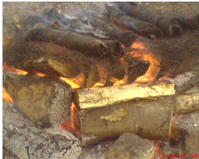
Figure 4. Singeing of cattle hides placed directly on metal stripes derived from burnt tyres (metal stripes are kept red-hot with minimum burning firewood)

The levels of heavy metals reported in the singed products were generally quite high when compared to reported cases of heavy metals concentrations in different meat products (Santhi et al., 2008; Koréneková et al., 2002). It appears that the substantial heavy metal levels in the un-singed hides contributed considerably to the overall high values recorded with singed treatment. This seems to suggest that other factors such as rearing conditions of animals, depicted by the relatively high levels of the metals in control hides, have also accounted for the quantum of heavy metals realised in the singed materials. Thus, the levels of heavy metals recorded in