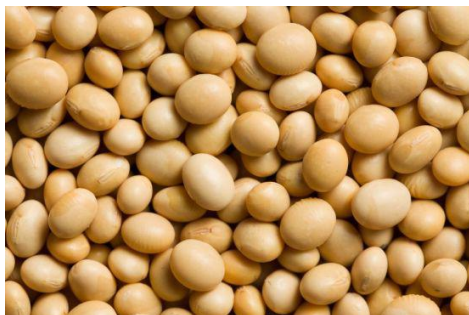
Figure 1; Soya bean seeds. [3]