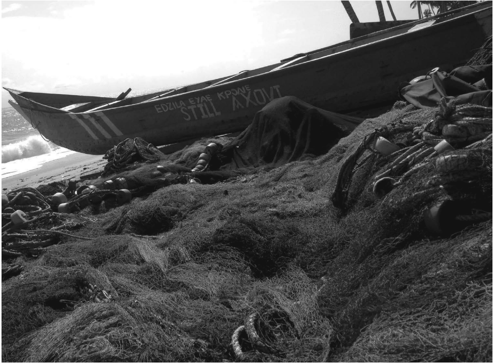
Figure 2: Example of an inscription on a canoe.

they sang two, one-hour medleys of fishing songs. Recording in the studio allowed for a ‘cleaner’ version of the songs devoid of the din that comes with their work at the shore. The examples of fishing songs that are referred to in this article are from these recordings.