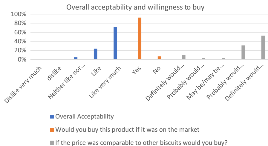
FIGURE 3 Overall acceptability and willingness to buy

Figure 2 shows the acceptability of the developed biscuits among 130 pregnant Ghanaian women. It was observed that majority of the pregnant women liked the biscuit very much in terms of the color, sweetness, aroma, and texture and are willing to buy the biscuits if it is sold on the market (Figures 2 and 3). The analysis of variance (ANOVA) showed that the overall acceptability of the biscuits was found to be significantly dependent on the sweetness ( p < 0.05 ). The acceptability was done among pregnant women because the study aimed to develop a product that would be acceptable among them and can be used to supplement their protein and iron intake to reduce the incidence of anemia and severe acute malnutrition. It seemed from the study that the use of palm weevil larvae in biscuit production reduced