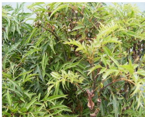
Figure 1: A picture of Polyscias fruticosa (L.) Harms showing the stem, leaves, flowers and fruits