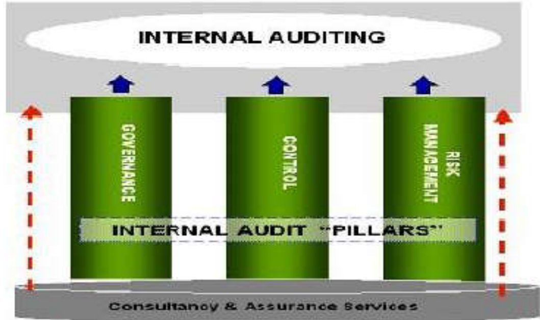
Figure 3 Three pillars of internal auditing