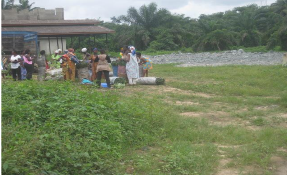
Figure 8: Mpohor Market

GSWL's interventional initiative, activities are very lively at the market place with no apprehension for flooding. Figure 8 shows a picture of the project.