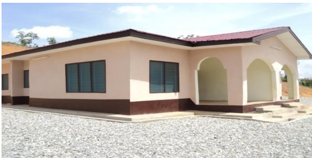
Figure 5: Ningo Teachers Quarters

It was found that, apart from classroom blocks, teachers quarters have also been built by GSWL in fulfilment of CSR activities in its catchment communities to serve as motivations for teachers to stay in the community to teach. Figure 5 is the picture of Teachers Quarters in Ningo Community.