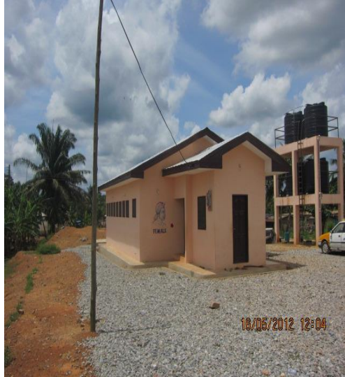
Fig. 10: Mpohor WC Toilet Facility