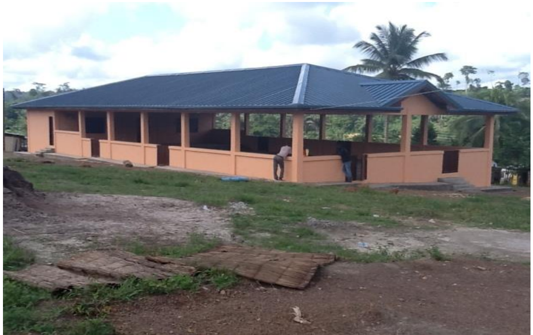
Figure 3: Subriso Community Centre