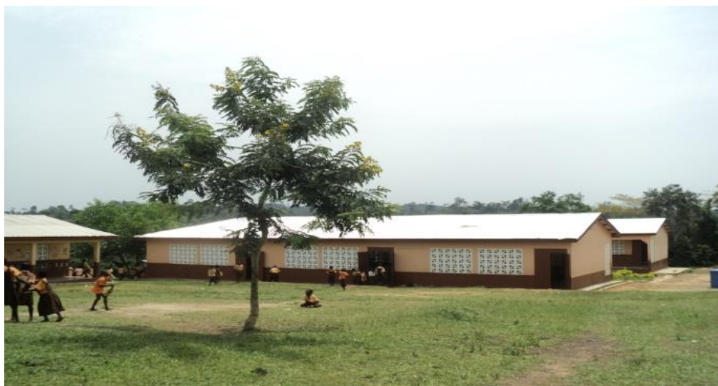
Figure 4: Akyempim 6 Unit Classroom Blocks