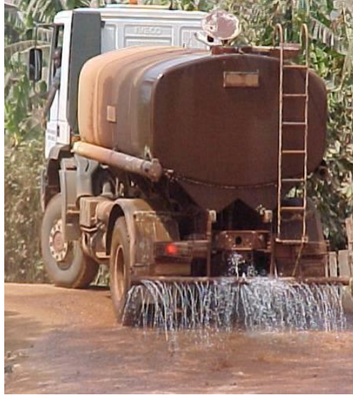
Figure 6: Water Boozer