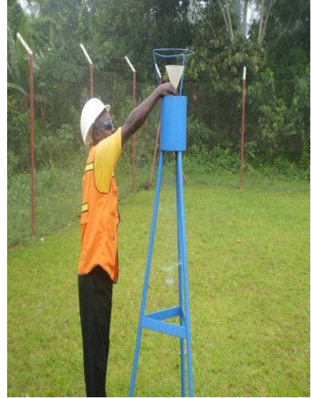
Figure 7: Dust Monitoring