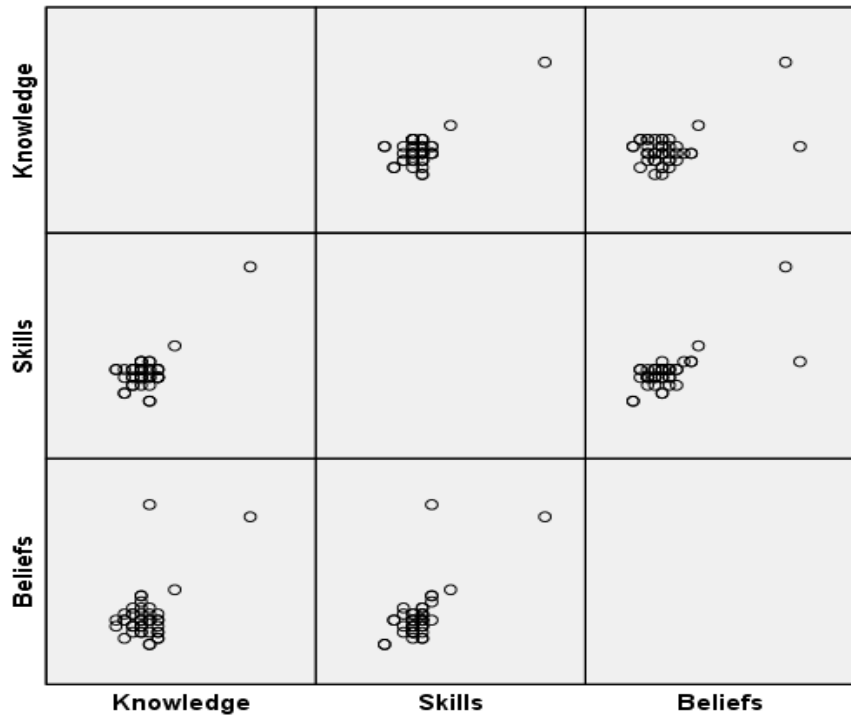
Figure 2: Correlation among CC Sections