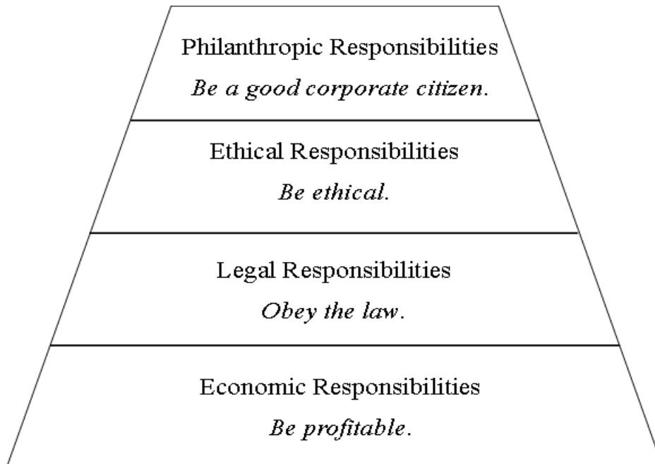
Figure 1: Pyramid of corporate social responsibility

CSR (Figure 1), and it is very accepted among researchers in this field and the most frequently cited in domestic and foreign literature (Park, Lee, & Kim, 2014; Stanisavljević, 2017), which is why this research is based on this definition of CSR.