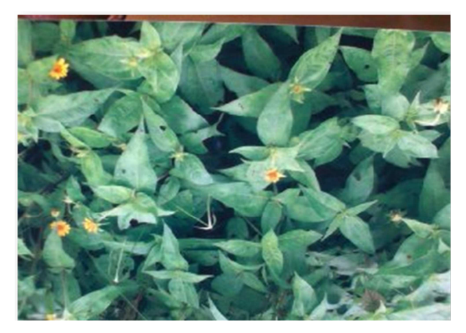
Figure 1. African marigold (Aspilia africana) plant.

Therefore, this study was conducted to examine the effect of administration of aqueous Aspilia africana extract on oestrogen and testosterone concentrations in West African Dwarf rams.