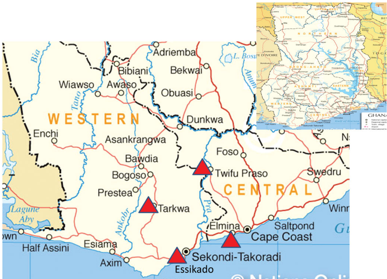
Figure 1. Map of the CR and WR of Ghana, showing the study areas (red triangle). Insert: map of Ghana.

Approval for this study was obtained from the Ghana Health Service Ethics Review Committee. Written, signed/ thumb printed and dated informed consent was obtained from adult participants, and in the case of children, from parents/ guardians before being enrolled in the study.