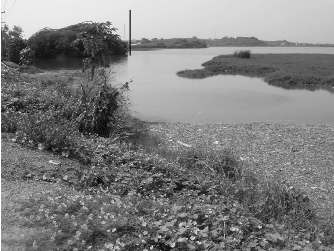
Figure 2. A photograph showing the Mangrove distribution in the Fosu Lagoon. The cluster of mangroves is to the left of the black line .