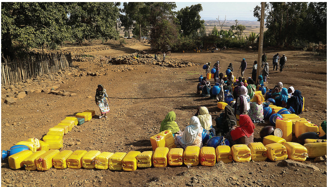
Photo: A borehole for people in Mankorkoria and Ansela Kebele, Ethiopia, serves 400 households who are allowed a couple of jerrycans every other day.

We also know that as supplies decrease or become intermittent and unreliable, households cope by storing water. Bottled water is one way to store water, as we have seen in high-income settings where panic